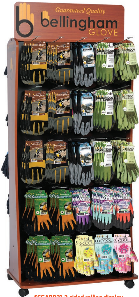
SCGARD21 2-sided rolling display