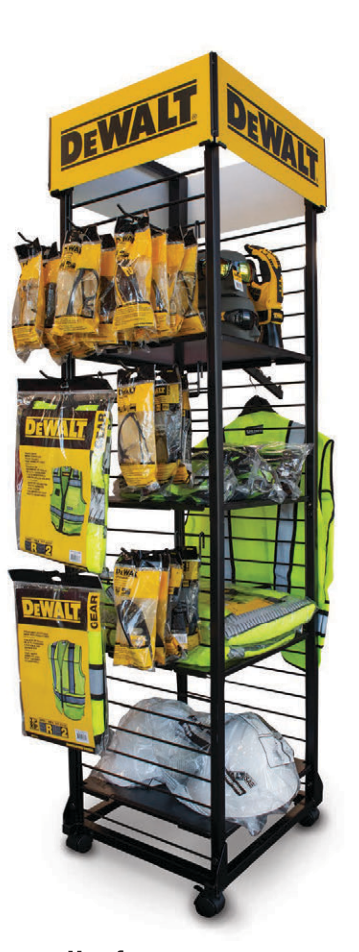
Use for any season