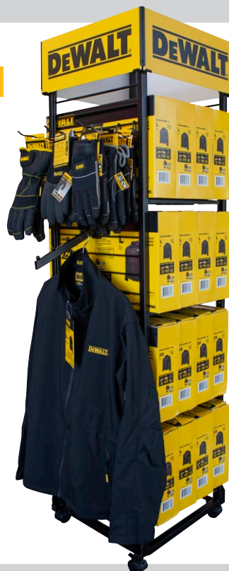
DHG-DISP-16 (Contact sales rep for details)